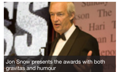
Jon Snow presents the awards with both gravitas and humour